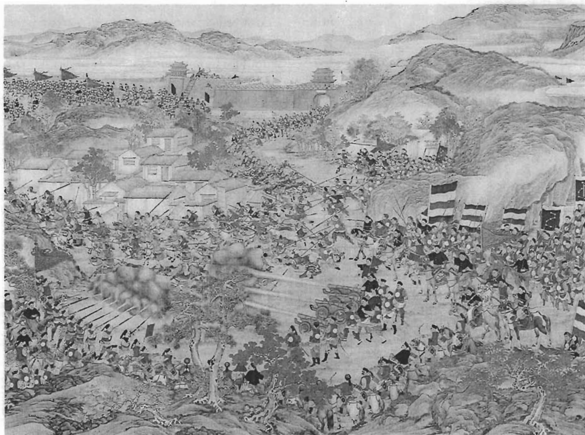
[101] detail of one of two