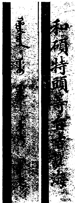
155 INSCRIPTIONS IN MANCHU AND CHINESE

E.J. Brill，《Catalogue 544》，萊頓，1985年，編號16