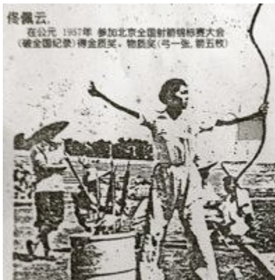
Last Manchu Archer 1