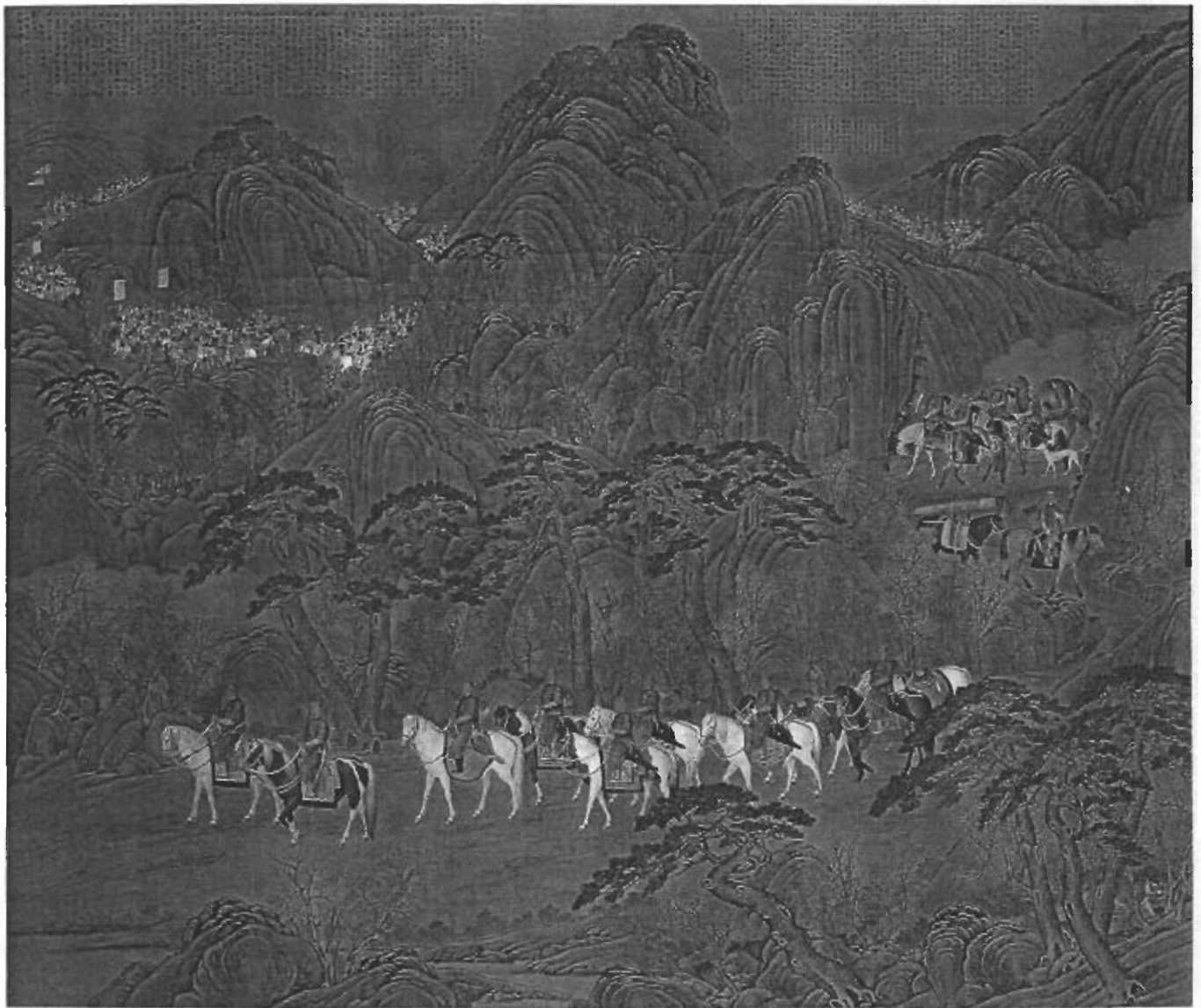
(Fig. 3) Deer Hunting Patrol , dated 1741 By Giuseppe Castiglione (1688-1766), Italian Ink and colour on silk Height 267.5 cm, width 319 cm The Palace Museum, Beijing