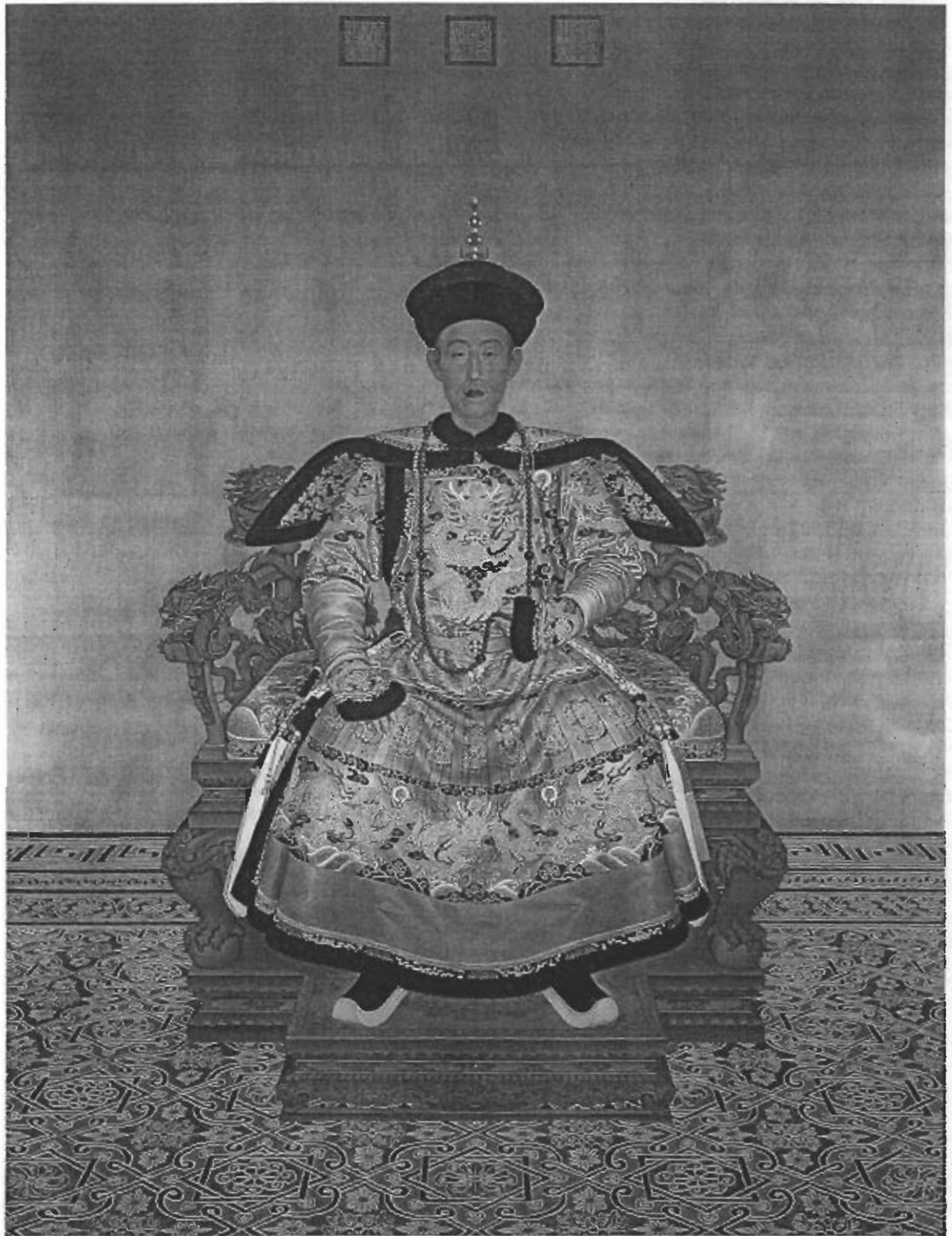
(Fig. 7) Portrait of the Emperor Qianlong in Ceremonial Dress By Giuseppe Castiglione (1688-1766), Italian Ink and colour on silk Height 242.2 cm, width 179 cm The Palace Museum, Beijing

Second, Castiglione used Chinese media in combination with a technique which relied on line and colour to produce a three-dimensional effect and linear beauty similar to the gongbi style. However, under close scrutiny, it is obvious that the colours on these paintings were applied in light and dark shades with no brush strokes apparent and that the works lack a