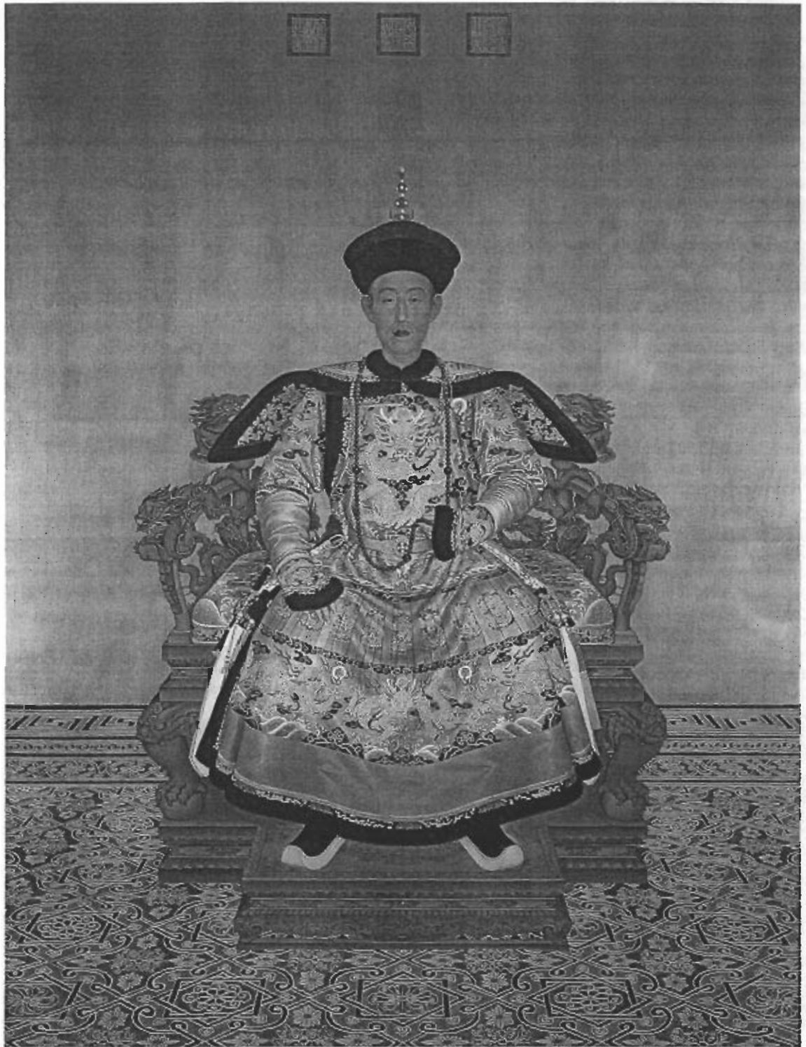
(Fig. 7) Portrait of the Emperor Qianlong in Ceremonial Dress

By Giuseppe Castiglione (1688-1766), Italian Ink and colour on silk Height 242.2 cm, width 179 cm The Palace Museum, Beijing