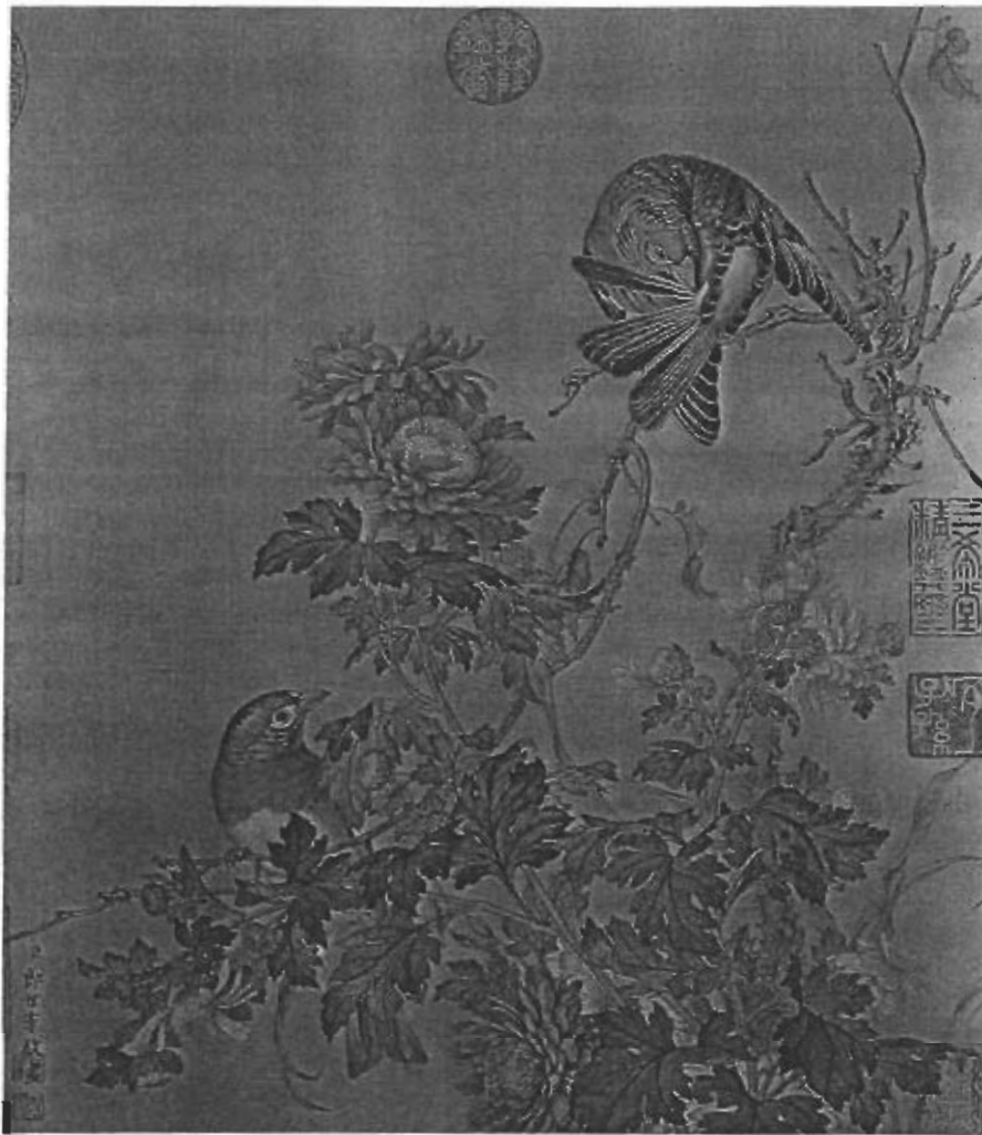
(Fig. 2) Chrysanthemums By Giuseppe Castiglione (1688-1766), Italian Painting on silk Height 33 cm, width 27 cm The National Palace Museum, Taipei

Castiglione's painting was not only affected by domestic activities, the military campaigns of the time also dictated the subject matter which he was required to paint. In 1759, Prince Hongli succeeded in repressing the rebellion between the Dzungars and the Moslems, although it had taken over four years to do so. This conflict became another fresh subject for Castiglione (Fig. 4), who was, together with other court painters, commissioned to produce sixteen illustrations of these battles, the first in a series of 'war' paintings.