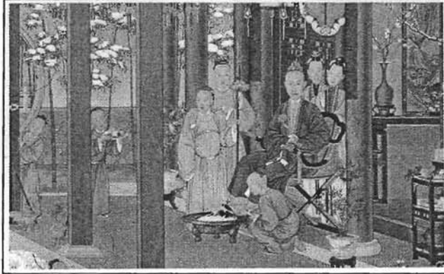
Detail of The Emperor's Birthday (p. 48)