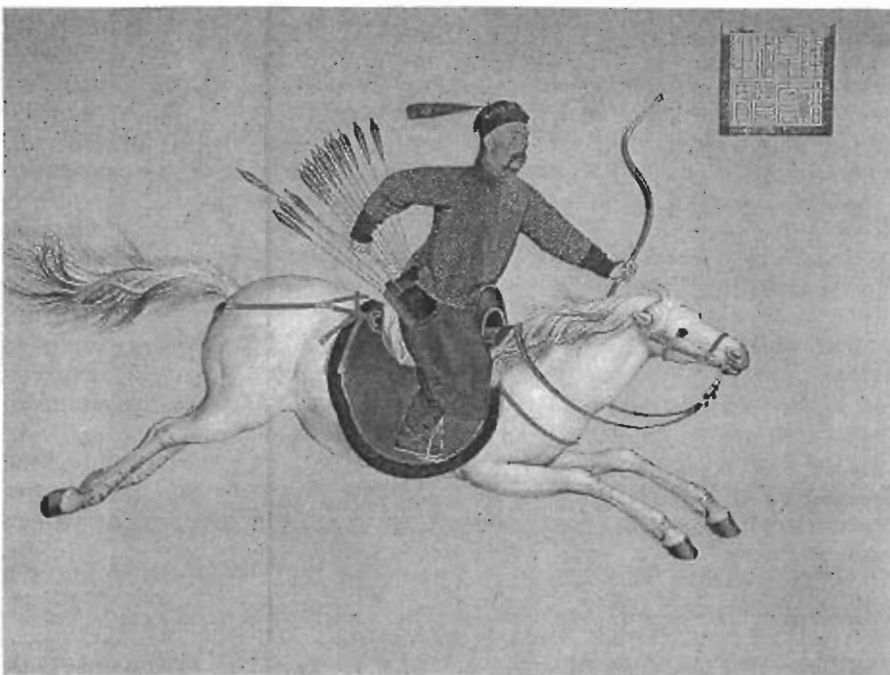
(Fig. 4) Ma Chang Attacking the Enemy's Camp , 1759 By Giuseppe Castiglione (1688-1766), Italian Painting on paper Height 38 cm, length 285 cm The National Palace Museum, Taipei