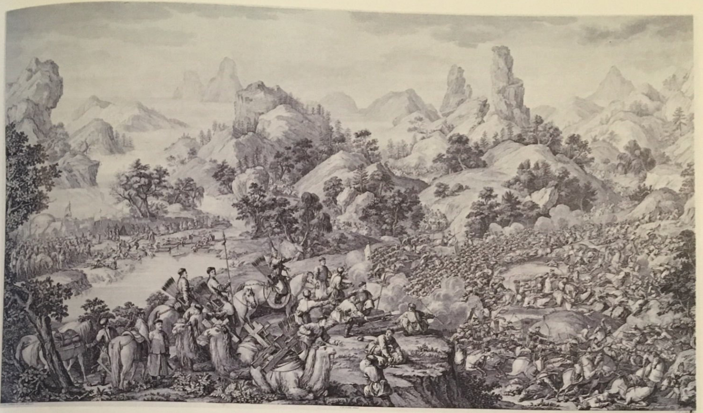
137 (one of fourteen)