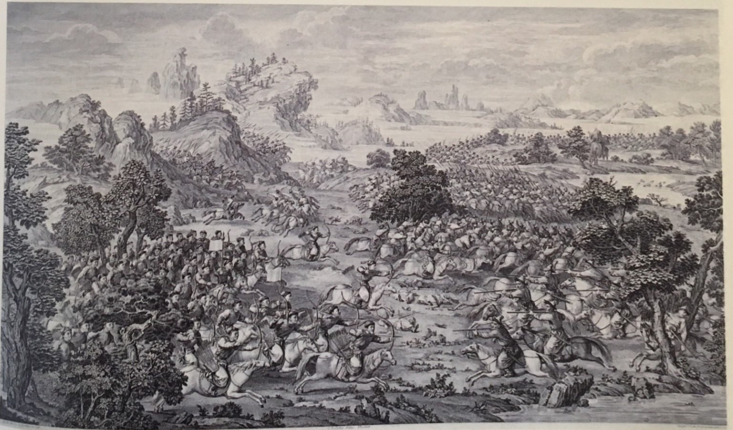
137 (one of fourteen)