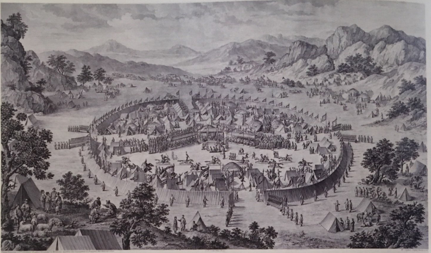
137 (one of fourteen)