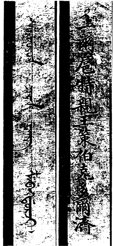
149 INSCRIPTIONS IN MANCHU AND CHINESE