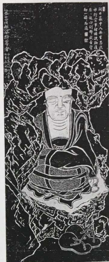
146 (part lot)